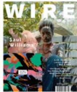
Current issue 452 August 2022 The Wire Support 59